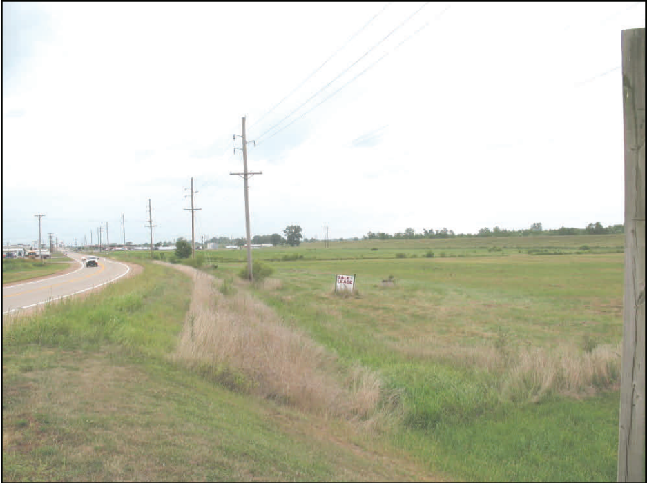
Nash Road, Scott City (Cape Girardeau), Missouri

Great traffic & visibility location near I-55 interchange. This 39.56 acre tract is adjacent to C-Store & truck stop. City utilities available with city fire & police protection. Will consider dividing.