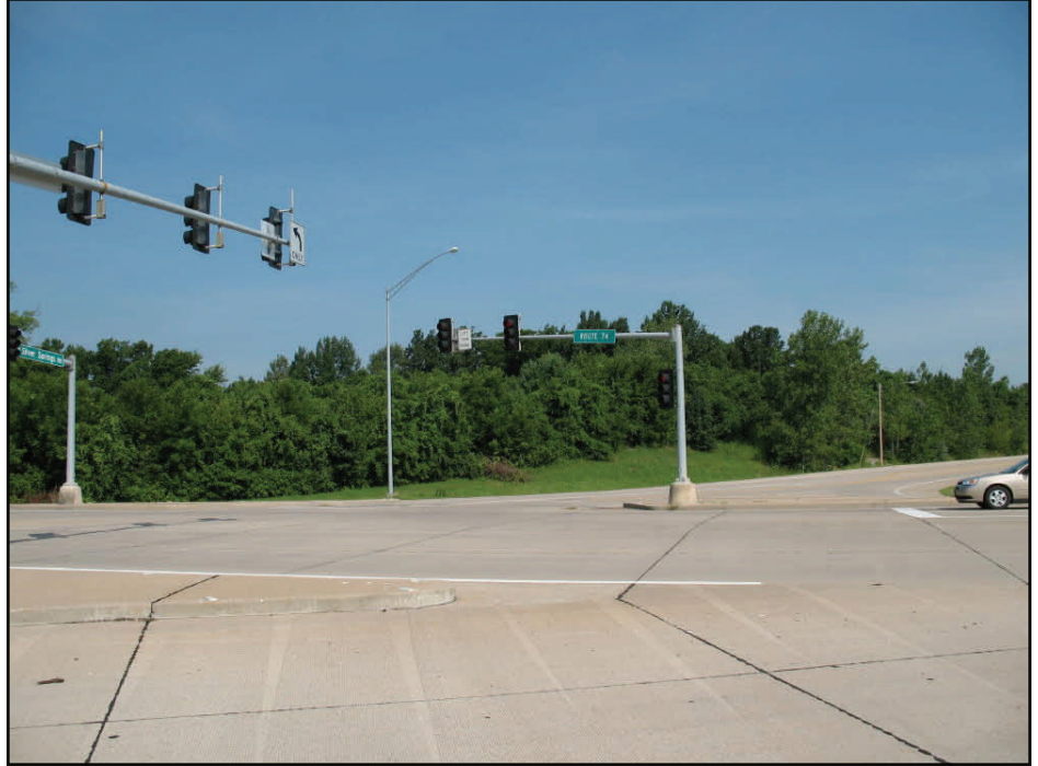
Hwy. 74 (Shawnee Parkway) & Silver Springs Road Cape Girardeau, Missouri

5.29 acres and .51 acre High traffic & visibility commercial tracts of land. Corner locations on a signaled four-lane intersection. City utilities available. Suitable for various uses. Contact Tom for copy of plat drawing and additional info.